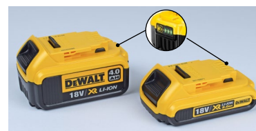
2.0Ah or 4.0Ah batteries available. All batteries with charge indicator.

Weight: 2.10 kg including 2.0Ah battery 2.42 kg including 4.0Ah battery