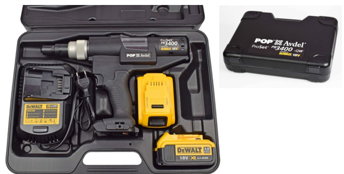
Robust tool case for outdoor installation. Different battery configurations available.*