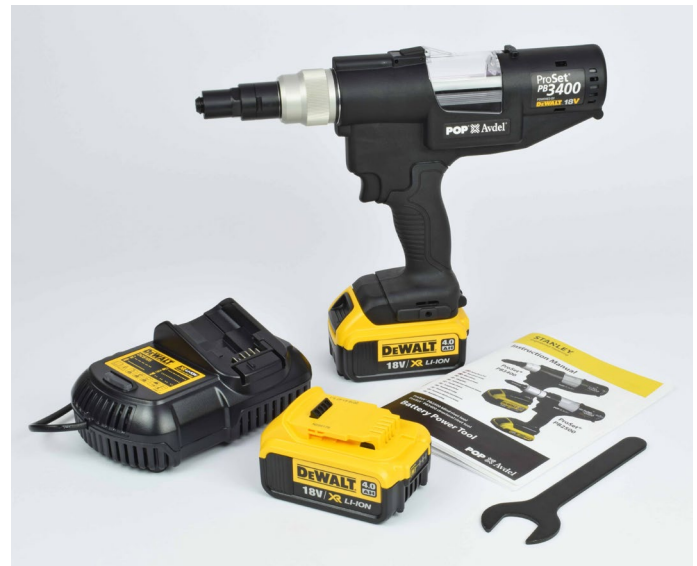
Tool delivered in sets with 18V DEWALT XR Li-Ion batteries* including fast charger and ø 6.4 mm flat nose piece equipment.